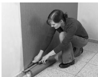
...and trimmed. That's all there is to it!

Smooth the lengths onto the wall using a paperhanging brush or cloth, or a sponge roller to remove bubbles.